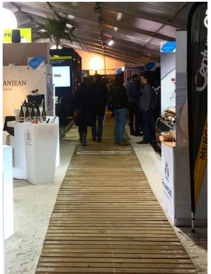
SIPRHO - Salon des Plages, La grande Motte, France.